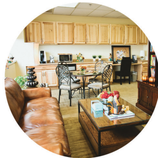
One Ronald McDonald House