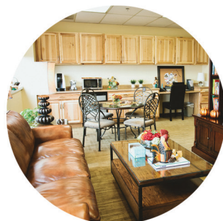
One Ronald McDonald House